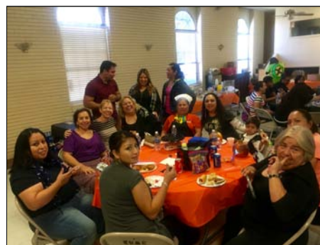
Level 2 English students enjoying their time together outside of class

Can you believe SSP has been serving families for eight years!?! Neither can we! This year we celebrated our eighth