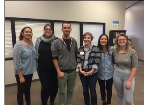
SSP Staff and Board Chair with some of our CreateAthon creative team

SSP Learning Center was selected to participate in CreateAthon 2016, hosted by BuildASign. CreateAthon is a 24-hour creative marathon of skills-based volunteering where volunteer creatives and designers from all over Austin come together to work in teams and provide pro bono work to local nonprofits. As a selected nonprofit, SSP briefed its assigned creative team on an organization re-brand to ultimately deliver a strong brand identity that will support our mission. Stay tuned as we reveal the results towards the end of the school year.